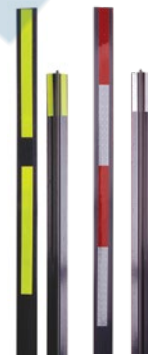
Priced per Package