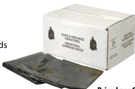
Priced per Case