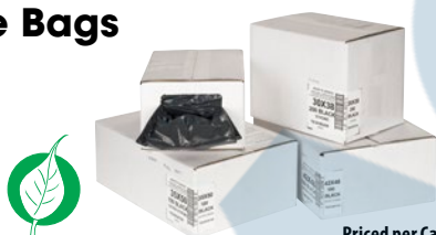
Priced per Case