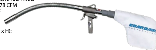
Model No. TYK118 Mfg. No. 1548 Price/Each $