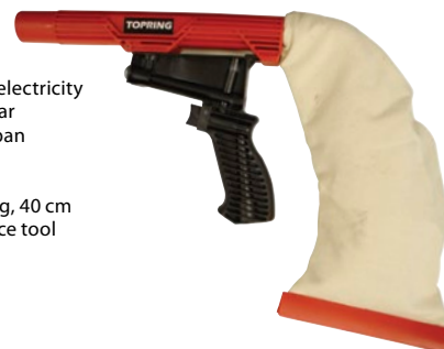
Model No. TG151 Mfg. No. 67.050 Price/Each $