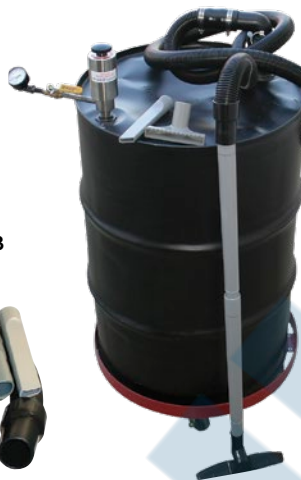
TG142 Drum not included