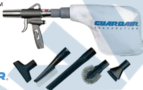
Model No. TYK117 Mfg. No. 1510 Price/Each $