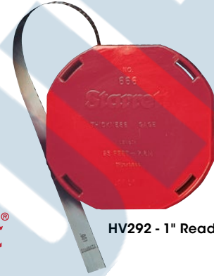
HV292 - 1" Reading Roll