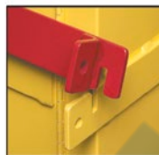
Contrasting crossbar can be completely removed from the cabinet when not in use.