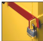
Support brackets are firmly welded to cabinet door for extra tamper resistance.