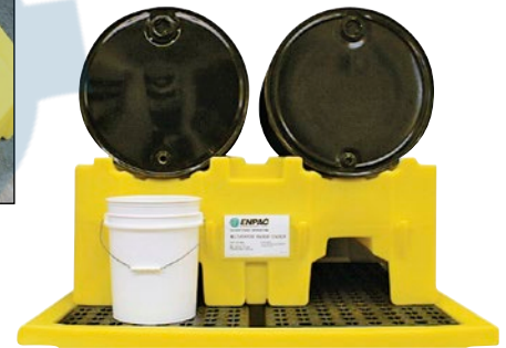
Drums, pail & pallet not included