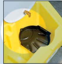
Universal® Well Liner