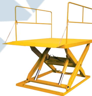
Portable scissor lift for raising loads to a mezzanine. Supplied with guard rails, safety chains & hinged plates. Sometimes mounted on V-groove wheels and angle track.