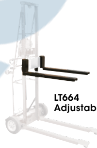
LT664 Adjustable Forks