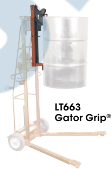
LT663 Gator Grip®