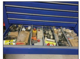
FN380 (Partitions only, cabinet not included)