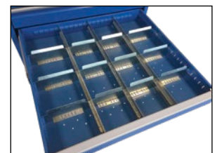
FN409 (Dividers only, partitions and cabinet not included)