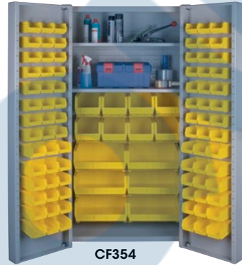
CF354 98 Bins