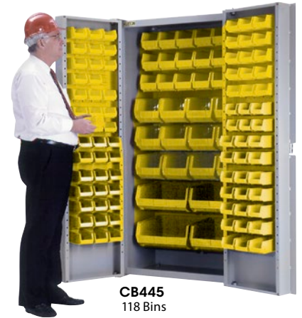
CB445 118 Bins