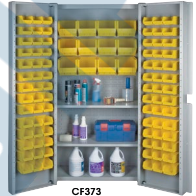
CF373 96 Bins