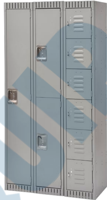
16-gauge frames, 24-gauge body and shelves