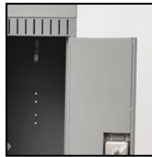
Double pan construction doors, 20-gauge outer and 24-gauge inner pans (single & double tier)