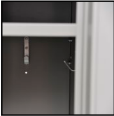
Three zinc-plated coat hooks and one shelf included with single and double tier lockers