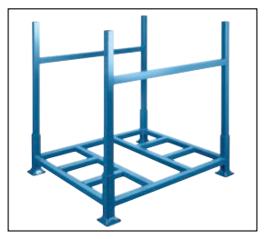
Model RL414 w/2 Model RI 419