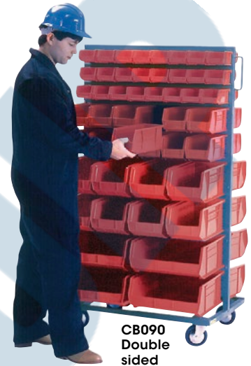
CB090 Double sided