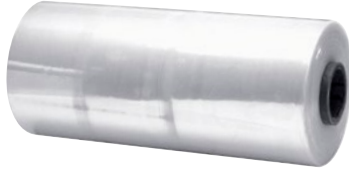
Priced per Roll