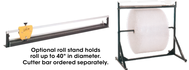
Optional roll stand holds roll up to 40" in diameter. Cutter bar ordered separately.

CALSTONE INC. Your Furniture Solutions Partner