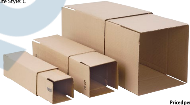
Priced per Box