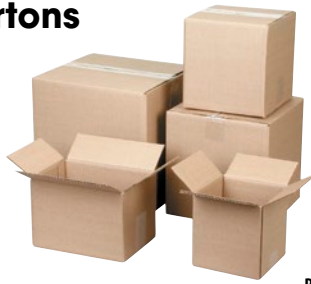
Priced per Box