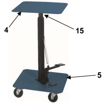
Figure 1 Model LT-02-1616