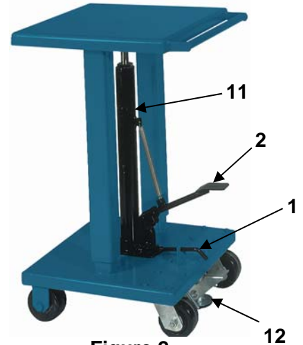
Figure 2 Model LT-05-1818