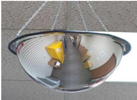
FULL DOME - 360°

USE FURNITURE POLISH TO CLEAN MIRRORS. GLASS CLEANER WILL DAMAGE SURFACE.