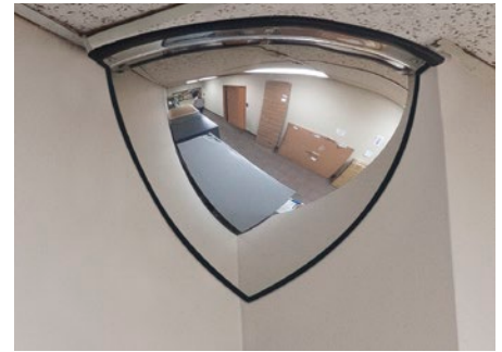
QUARTER DOME - 90°

* The dimensions listed are that of a full dome