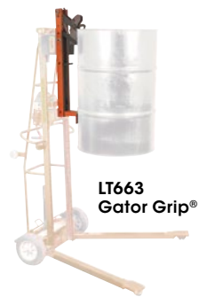
LT663 Gator Grip®