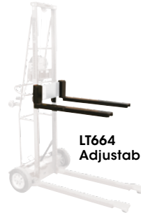
LT664 Adjustable Forks