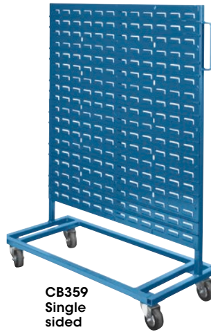
CB359 Single sided