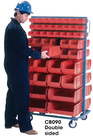
CB090 Double sided