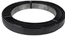
Priced per Spool